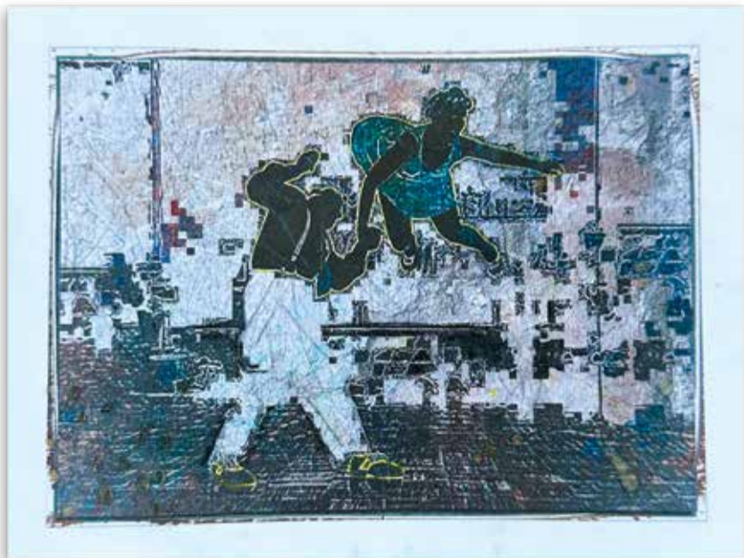
UNTITLED | KUSHAG

I mainly use paper to print, draw, collage, make notes, and make lists... and therefore I mostly use paper to make art, express, communicate, preserve, organise.