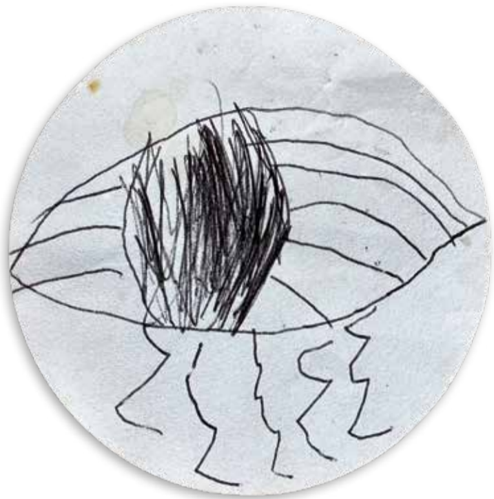
EYE | UNKNOWN ARTIST